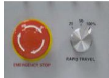
Figure 5-1 Emergency stop button.

"JOG AXES TO HOME POSITIONS, THEN ENTER THE CS COMMAND" appears, continue with the following steps.